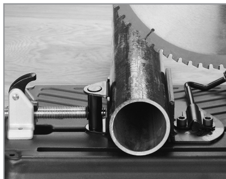
Always clamp material securely