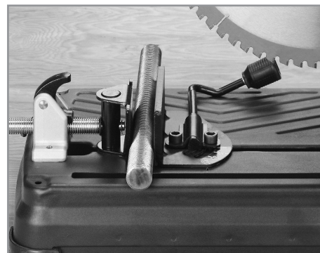
Cut forward of the blade center line and never cut bundles