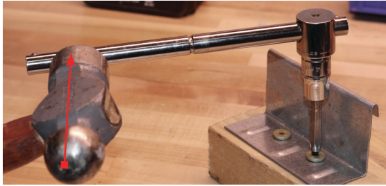
This is an example of how an impact tool works. It "hammers" the screw in a rotating fashion during installation.

Using impact tools to install self-drilling and self-tapping screws can cause failure to screw, paint, and sealing washer!